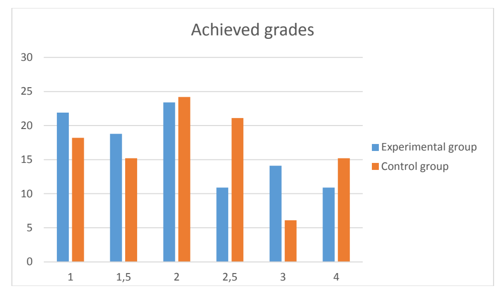
Figure 1. A graphic representation of the achieved grades.

Table 3 shows the finding: At the significance level of 5% ( \alpha = 0.05), the hypothesis H_1 was rejected because the probability p > \alpha , that is, the difference between the experimental and the control groups is not significant in the grades achieved in an idiomatic test.